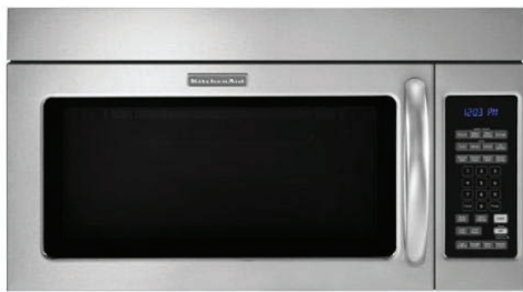
Kitchen Aid Stainless Steel 2 cu. ft. Microhood combo Microwave Oven