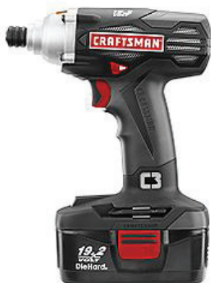
Craftsman 19.2 Volt Cordless Impact Driver Set