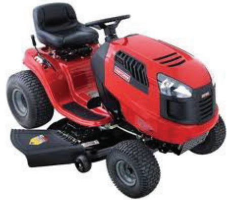
Craftsman 19.5 hp 42 in.