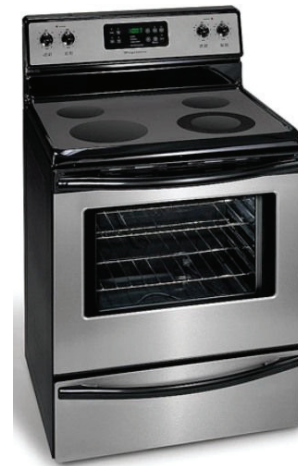
Frigidaire Stainless w/Black 30 in. Freestanding Electric Range