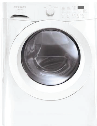
Frigidaire Affinity White 3.3 cu. ft. Front Load Washer