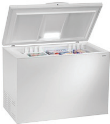
White Kenmore 14.8 cu. ft. Chest Freezer