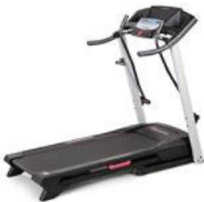
ProForm Crosswalk 397 Treadmill