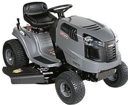
Craftsman 17.5 hp 42 in. Lawn Tractor