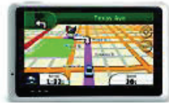
Garmin Nuvi 4.3in. GPS Navigation System w/lifetime Maps