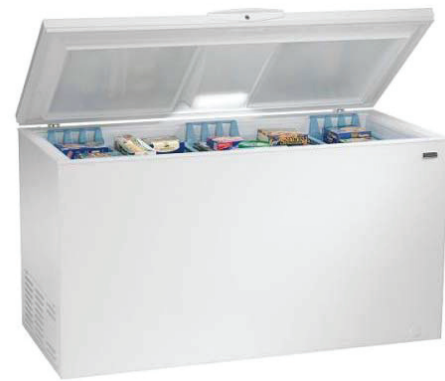
Kenmore White 19.7 cu. ft. Chest Freezer