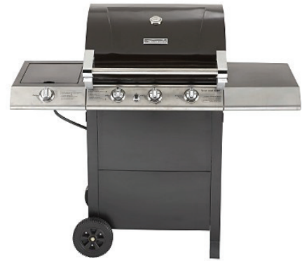
Kenmore 650 sq. in. 4 Burner Gas Grill, 40,000 BTU