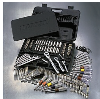
Craftsman 154 pc. 6 pt. Mechanics Tool Set