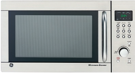
Kenmore Stainless Steel 1.2 cu. ft. Countertop Microwave