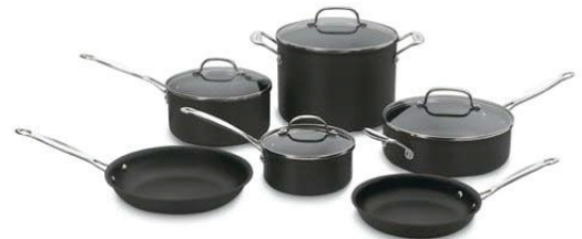
Cuisinart 10 - piece Chef's Classic Cookware Set