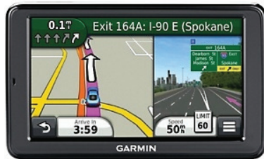
Garmin 5 in. GPS Navigation System w/Lifetime Maps/Updates