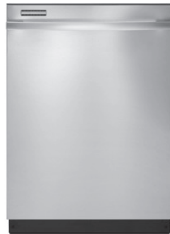
Kenmore 24 in. Stainless Steel Dishwasher