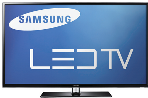
Samsung 51 in. Class 1080p 3D Plasma HDTV Television