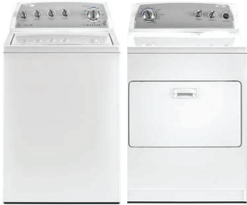
Whirlpool 3.6 cu. ft. Top-Load Washer/7.0 cu. ft. Dryer, White