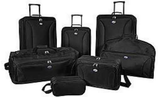
American Tourister 7-piece Luggage Set, Charcoal