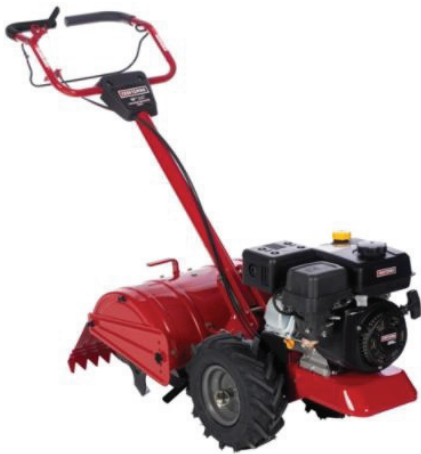
Craftsman 208 cc Rotating Rear Tine Tiller