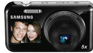
Samsung 14.2 MP Digital Camera