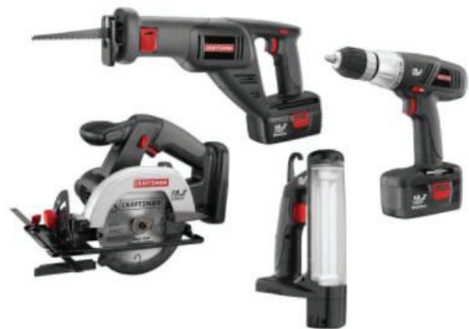
Craftsman Nextec 12 Volt Cordless Combo