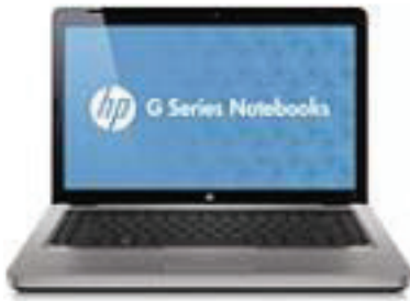
Hewlett-Packard Pavilion 14 in. Notebook PC