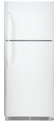
White Kenmore 18.2 cu. ft. Top Freezer Refrigerator