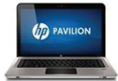
Hewlett-Packard ProBook 13.3 in. LED Notebook