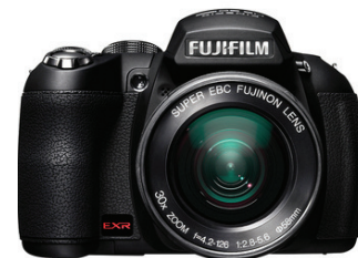
Fuji 16 MP Compact Camera Starter Kit