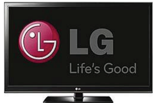
LG 50 in. Class 720p Plasma HDTV Television