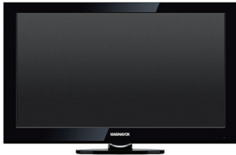
Magnavox 22in. LCD HDTV Television w/built-in DVD Player