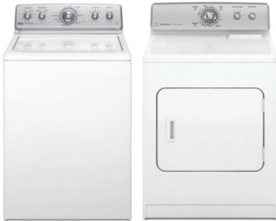
Maytag 3.4 cu. ft. Top-Load Super Capacity Washer/7.0 cu. ft. Dryer