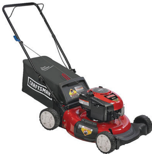
Craftsman 190 cc 21 in. Lawn Mower