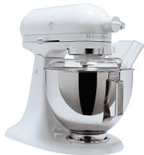
Kitchen Aid 4.5 qt. Stand Mixer