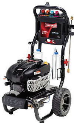
Craftsman 3000 psi 2.7 GPM Pressure Washer