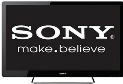
Sony 40 in. LCD HDTV Television