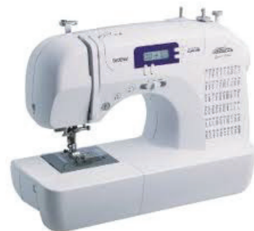
Brother Sewing Machine