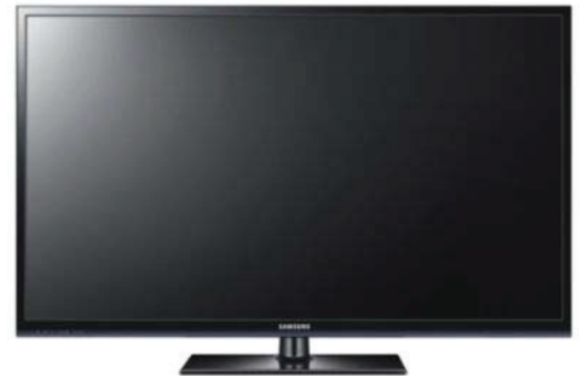
Samsung 51 in. Class 1080p Plasma HDTV Television