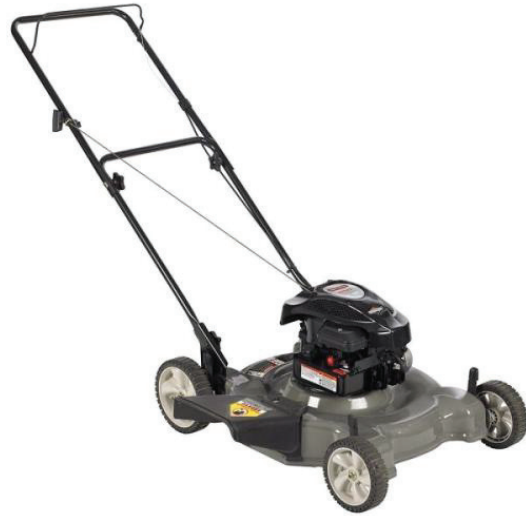
Craftsman 158 cc 21 in. Push Mower