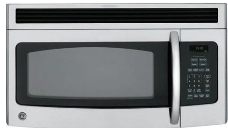
LG Over-the-Range Microwave Oven 1.6 cu. ft. , Stainless Steel