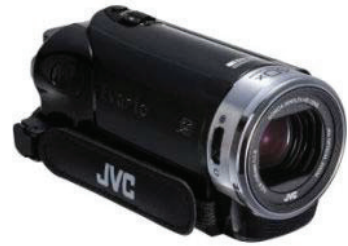
JVC HD Digital Camcorder