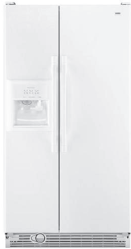
Kenmore 25.1 cu. ft. Side by Side Refrigerator, w/Ice/Water Dispenser, White