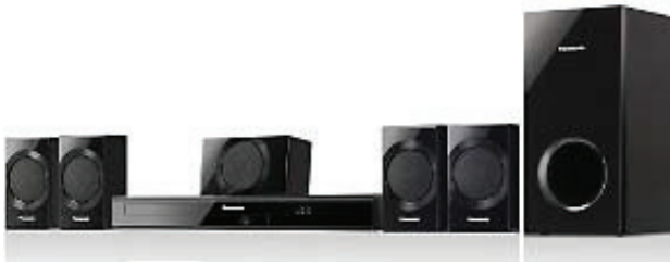
Panasonic DVD Home Theater System