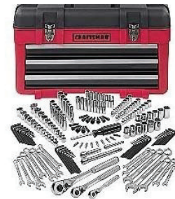
Craftsman 182 pc. Mechanics Tool Set