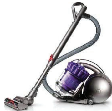
Dyson DC-39 Multi Floors Canister Vacuum