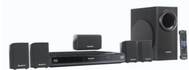
Panasonic Full HD 3D Blue-ray Disc Player