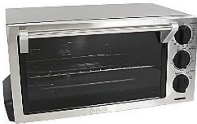
Delonghi 7 cu. ft. Convection Oven