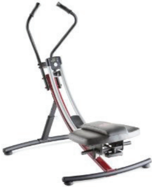
ProForm Ab Glider Platinum