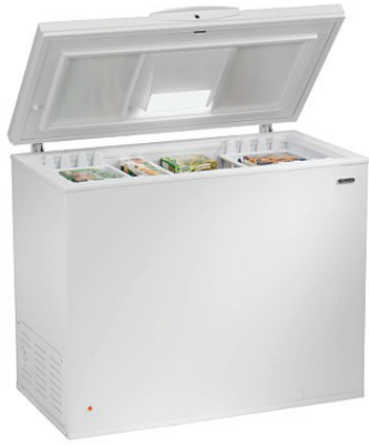
Kenmore 6.9 cu. ft. Chest Freezer