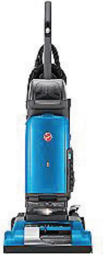
Hoover Upright Vacuum