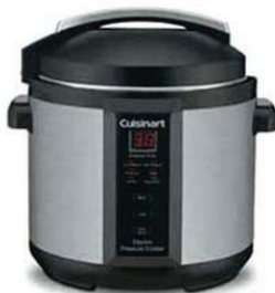
Cuisinart 6 qt. Pressure Cooker