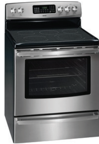
Kenmore Stainless w/Black 30 in. Freestanding Electric Range