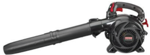
Craftsman 25 cc Gas Blower/Vac