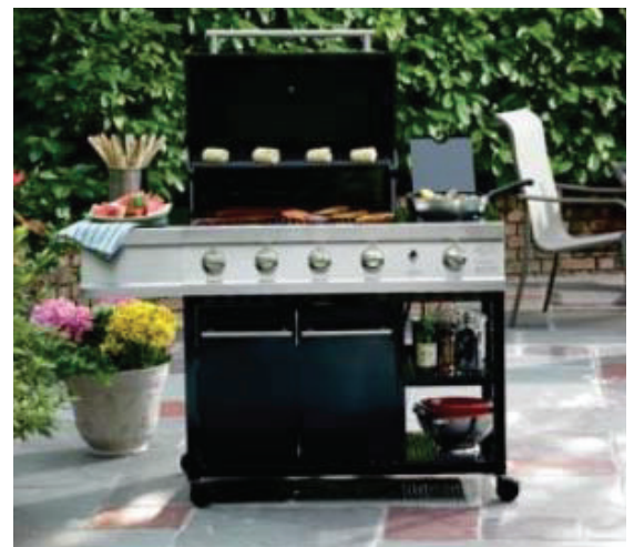
Kenmore 661 sq. in. 4 Burner Gas Grill 40,000 BTU